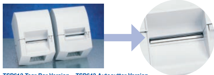
TSP613 Tear Bar Version TSP643 Autocutter Version

Unique Tear Bar Version As well as an autocutter version, Star has included a unique tear bar version in the range which will offer potential users an even lower cost option.